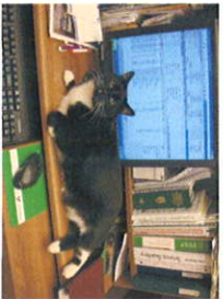
“The Clinic Greeter”